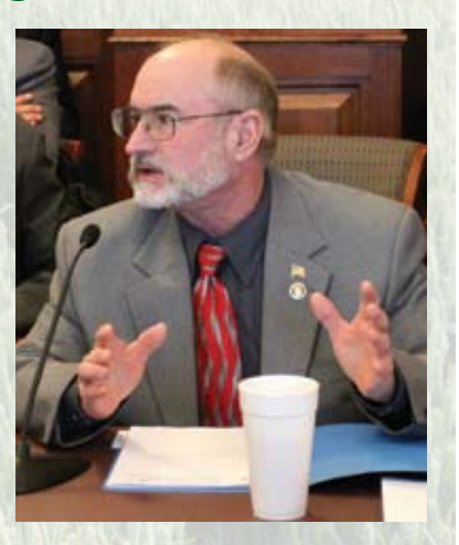
Sen. Munzlinger presented Senate Bill 16 to the Senate Agriculture, Food Production and Outdoor Resources Committee on Jan. 23, 2013.

The new law will take effect on Aug. 28, 2013.