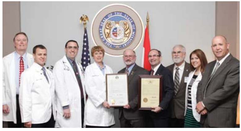
Osteopathic students from ATSU visited the Capitol on April 27, 2013.